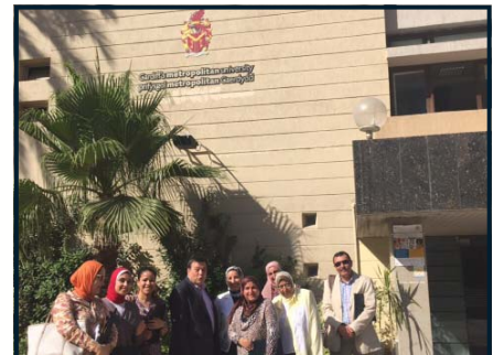
The team assembling ready to take the course