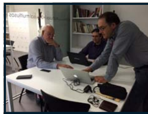
The team in Salamanca preparing the final videos