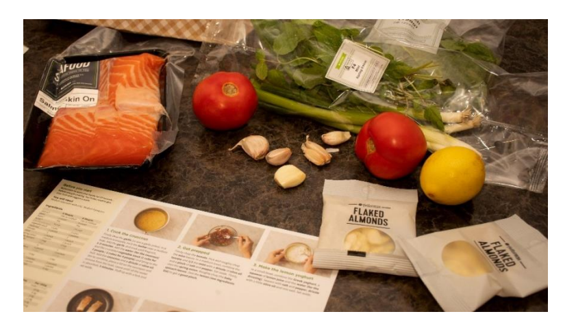
Figure 1. Example of meal-kit recipe box contents and recipe card

Research suggests that the inclusion of food-safety information in recipes may improve consumer food-safety practices<sup>5</sup>. However, little is currently known regarding providing, understanding and using food-safety information in meal-kit recipe cards.