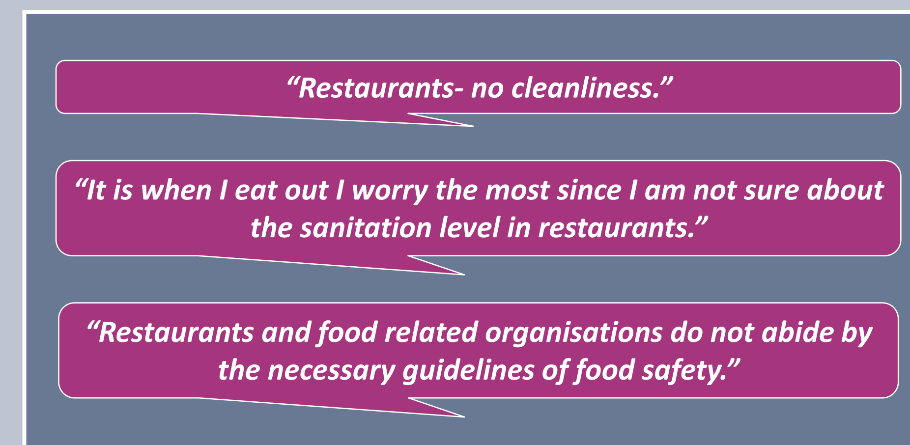
Figure 1. Consumer food safety concerns regarding restaurants.

Consumers perceived their overall personal risk of foodborne illness in Lebanon to be high. Restaurants in particular were cited by many as a very likely place to contract a foodborne illness, with some participants reporting to avoiding eating outside of the home altogether.