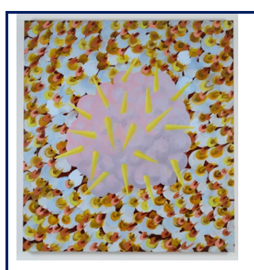
Wandering Star 2020. Distemper & Oil on Canvas 107x96cm