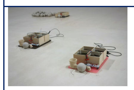
Mudbots Version 1.0 2018. Mud-powered mobile machines

I am interested in how art can interrogate the invisible. In my work I attempt to make tangible something that doesn't have physical form but holds power—something alien, supernatural, beyond the corporeal. Humanity has been driven to attempt this for millennia, through depictions of deities: human constructs of something beyond physical experience which have no concrete presence. I am fascinated by this human need to realise form from the unknowable and use the language of abstraction to pursue the underlying potentiality embedded within these ideas. There is a transfiguration that can occur in painting, particularly through the materiality of oil paint, that offers a space of imagination beyond the purely physical: it is this that I try to reveal through painting. These ideas originate in my contemplation of the enormity of the universe, whether it has a structure, the insignificance of humanity and a sense of awe at the unknown; what does all this mean and is it possible to comprehend? Considering all this, making paintings that attempt to explore the idea of representing something that doesn't exist in physical form somehow still seems like a sensible endeavour.