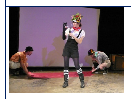
The World is a Weirdo Video Still