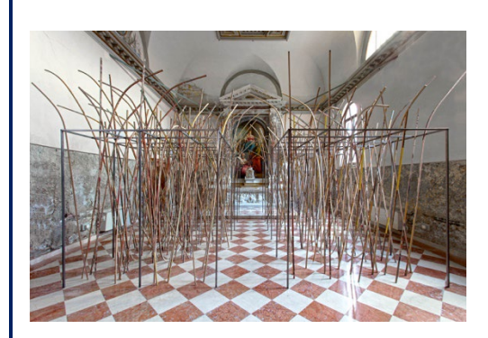
The Undo Things Done Installation the Welsh Pavilion Venice Biennale 2019