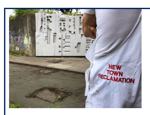
New Town Reclamation 2018