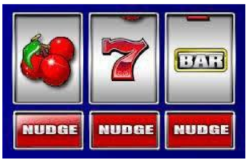
Figure 1 The 3 Reels of a Fruit Machine

1.1.9 (Harder) Design and build a fruit machine game, representing the 3 reels of symbols by numbers ranging from 0 to 9, randomly chosen each time the player asks to take another go.