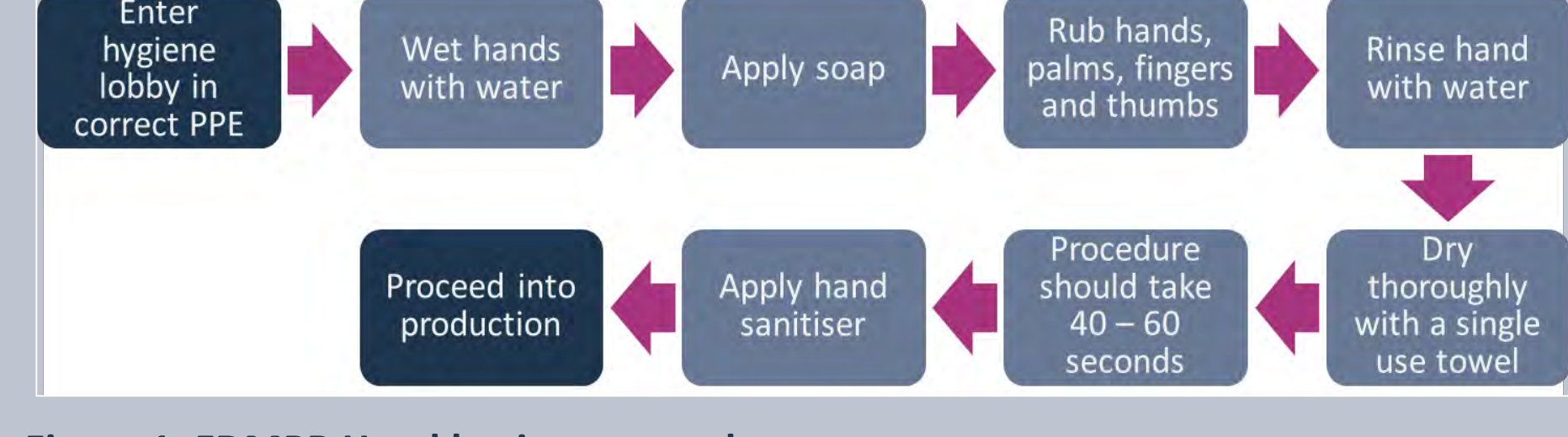
Figure 1. FDMPB Hand hygiene procedure

A total of 1333 entries in to the production hygiene lobby were observed over a period of 24 hours, of which 674 were entering production and 659 were exiting production. Compliance of each entry into the hygiene lobby was observed for compliance with the FDMPB hand hygiene protocol (Figure 1).