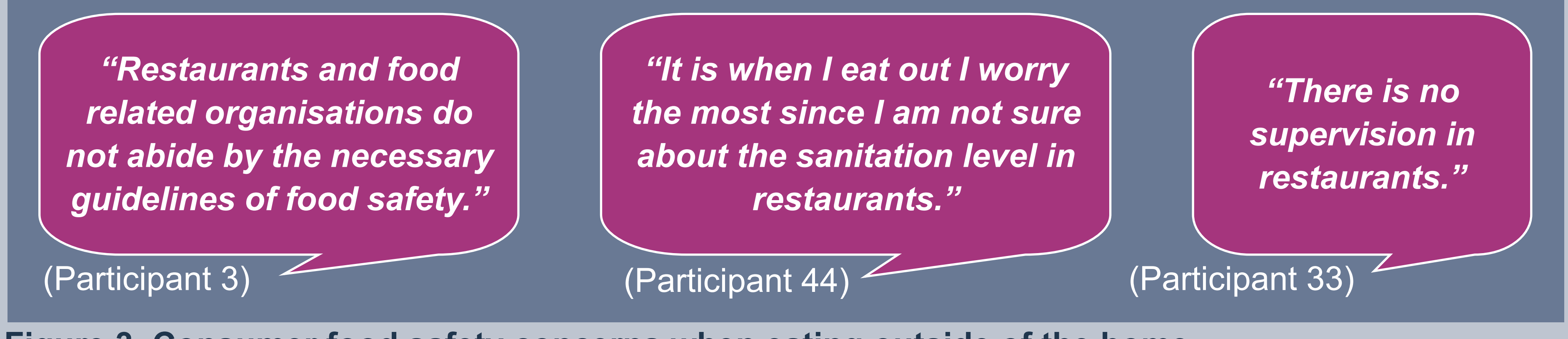
Figure 3. Consumer food safety concerns when eating outside of the home

Restaurants were cited by many as a likely place to contract a foodborne illness, with some participants reporting to avoiding eating outside of the home altogether (Figure 3). Respondents perceived that restaurants fail to ensure supervision of staff and adherence of food safety guidelines. Furthermore, concerns regarding hygiene standards were expressed.