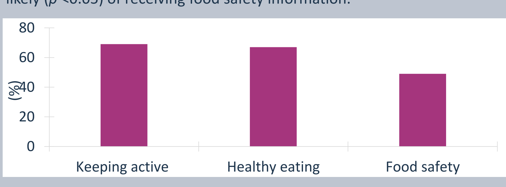
Figure 2. Recall of health related information received during chemotherapy ( n =130) Overall, weak positive attitudes were expressed towards the importance of food safety during chemotherapy treatment.

Furthermore, significantly greater proportions (p<0.05) reported receiving information on healthy eating and keeping active (67 – 69%) than on food safety (49%) during chemotherapy treatment (Figure 2). Neutropenic, blood-related cancer and transplant patients were significantly more likely (p<0.05) of receiving food safety information.