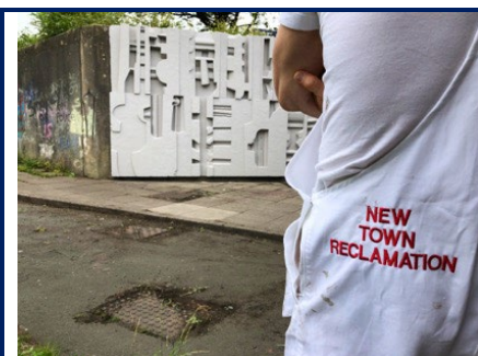
New Town Reclamation 2018