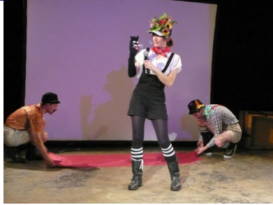
The World is a Weirdo Video Still