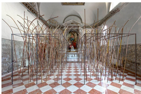
The Undo Things Done Installation the Welsh Pavilion Venice Biennale 2019