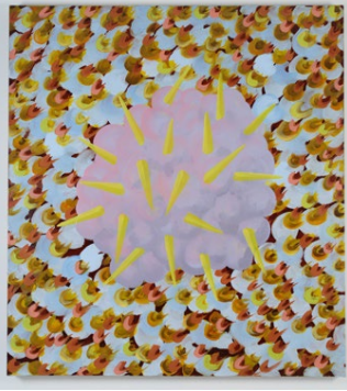
Wandering Star 2020. Distemper & Oil on Canvas 107x96cm