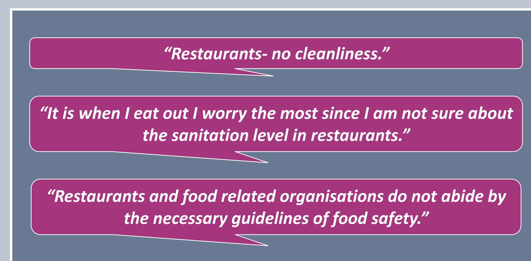
Figure 1. Consumer food safety concerns regarding restaurants.

Consumers perceived their overall personal risk of foodborne illness in Lebanon to be high. Restaurants in particular were cited by many as a very likely place to contract a foodborne illness, with some participants reporting to avoiding eating outside of the home altogether.